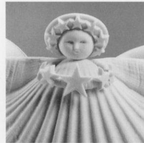
THE CELESTIAL ANGEL, 1988 • Edition of 3,000

The "Angel of Light" is the third design in the five-year limited edition "Gifts from God" series. This angel holds a bold image of the sun, a symbol of light and enlightenment. The angel celebrates not only the blessings of God's beautiful light in the physical realm but also the spiritual enlightenment He offers to every man, enabling us to recognize and accept truth. The strong, round image of the sun is embellished with stylized rays which also frame the angel's face.