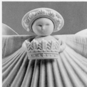
THE CORONATION ANGEL, 1989 • Edition of 3,000

The "Celestial" is the fourth design in the five-year limited edition "Gifts from God" series. This angel is embellished with stars. She carries her symbols of eternity by the armful with more stars encircling her head. The stars shine joyfully through the darkness reflecting heaven, the culmination of God's gift of eternal life.