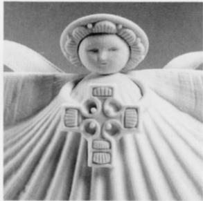
THE CHARIS ANGEL, 1985 • Edition of 3,000

"And the angel said unto them, Fear not, for behold, I bring you good tidings of great joy, which shall be to all people. For unto you is born this day in the city of David, a Savior, which is Christ the Lord." Luke 2:10,11