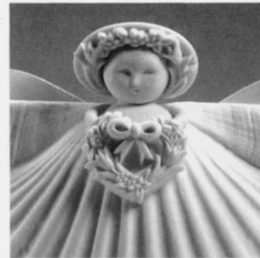
THE HALLELUJAH ANGEL, 1986 • Edition of 3,000